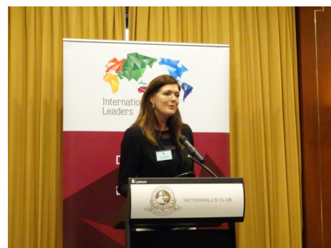
Brand Displayed at Keynote Address